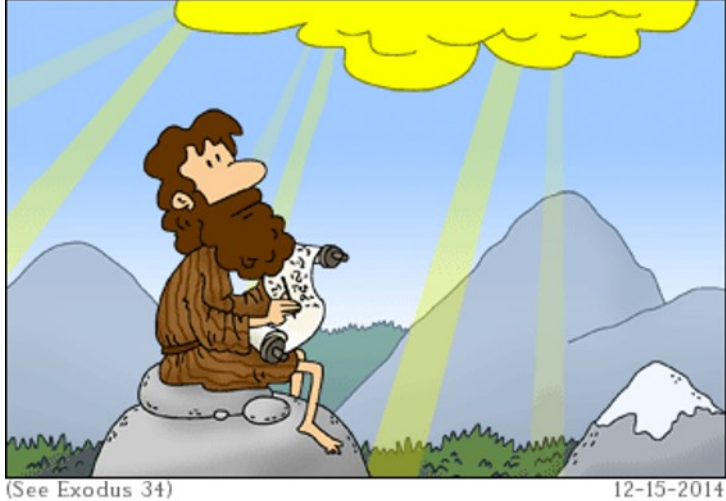
THESE WILL NEED TO LAST A WHILE ... YOU SHOULD PROBABLY JOT THEM DOWN ON STONE